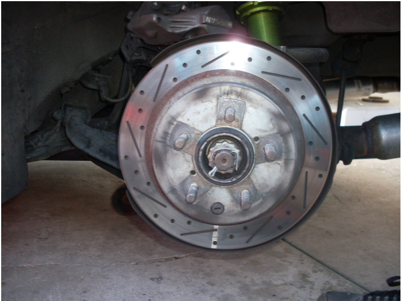
Step 5: If handbrake is on, place in the lowered position. Remove rear Rotor.