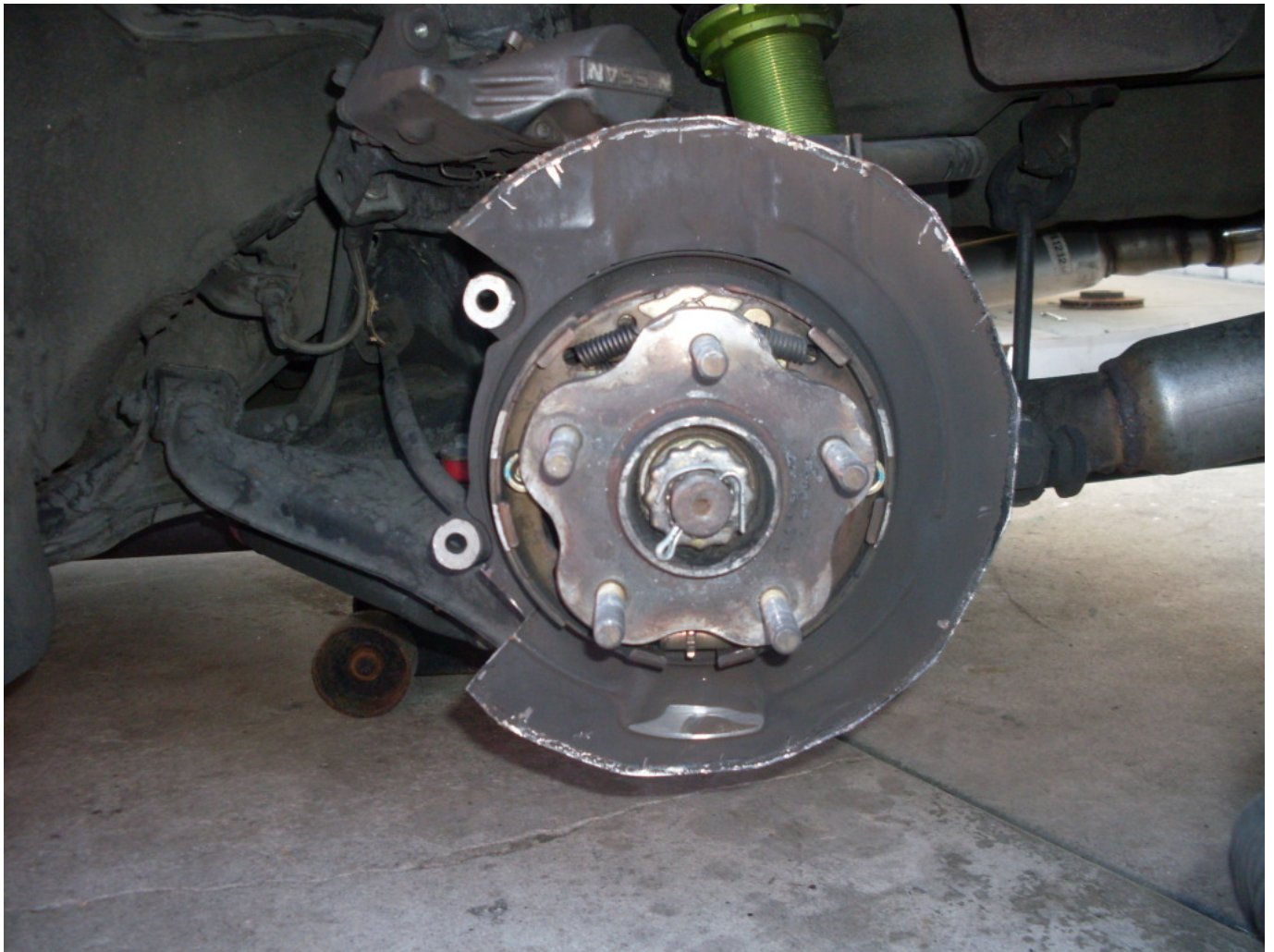
Step 7: Grab Driver -Side Brake ( Pictured ) and 2 bolts, 2 washers and 2 locking nuts. Install bracket as shown and torque down to 29-38 Ft-lbs