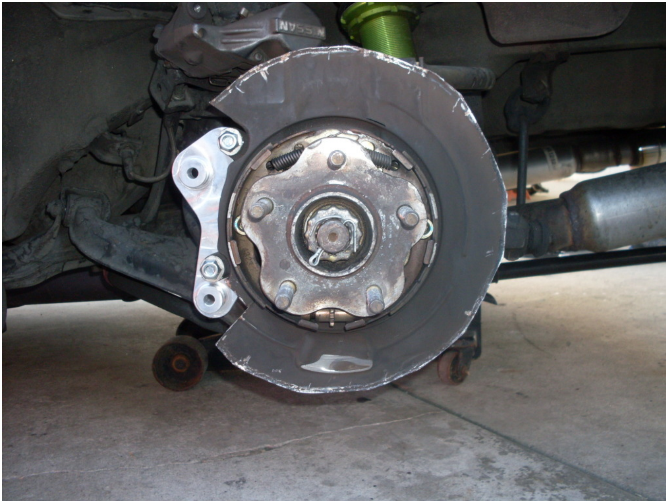
Step 8: Install Driver-Side Rotor ( Check to make sure the heat shield is not touching the rotor )