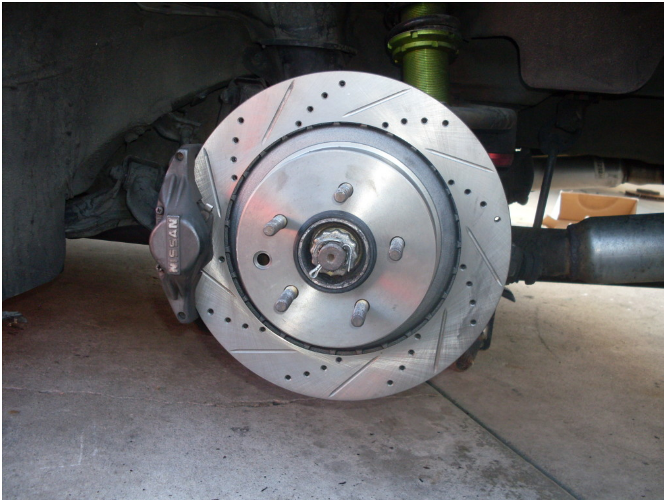
Step 10: Install wheel, Torque to 72 -87 ft-lbs