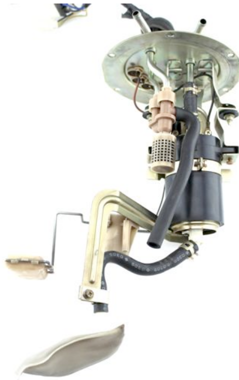
< Z32 Assembly Shown