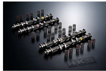
HKS high duration camshafts ensure the smooth acceleration to high engine speed.