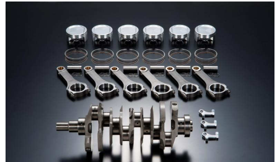
Full billet crankshaft with high efficiency balancing weights reduces engine vibration, is lightweight, and delivers high engine response.

A complete engine which can be matched to turbos of various sizes