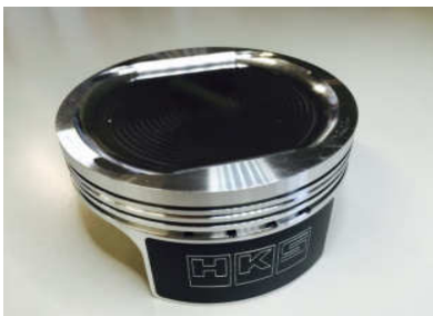
Molybdenum coated billet pistons reduce friction and prevents galling at the initial stage.

A complete engine which can be matched to turbos of various sizes