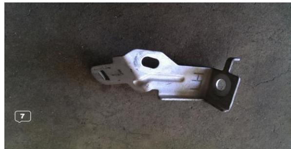
7. Remove the Sensor Wire Brackets on Both Sides, See Bottom Pictures