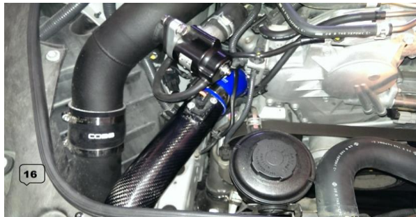
16. Passenger Side View