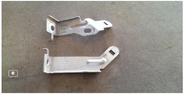
8. RH and LH Wire Sensor Brackets, Required Removed to be able to Install the CF Intake Pipes