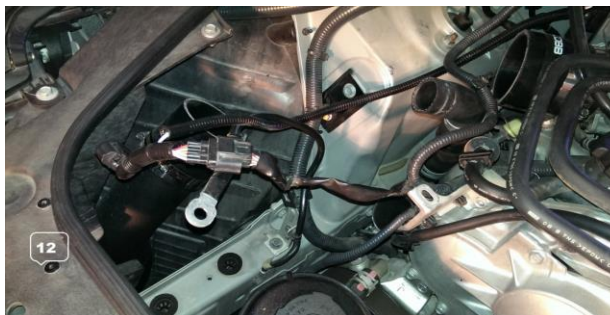
12. Same Procedures Apply to the Other Side