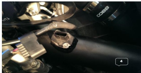
4. Unplug the MAF Sensor on Both sides