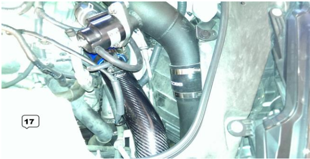
17. Driver Side View