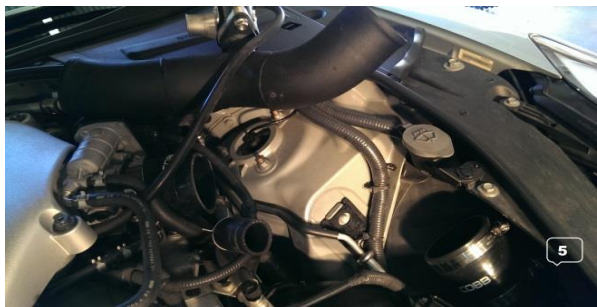
5. Loosen up the Upper Hard Pipes on both sides