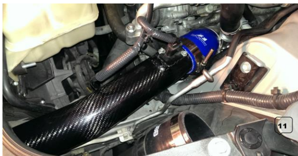
11. Using 2.75"-2.5" Reducers and Clamp to the Turbo Housing, Plug the MAF sensor Wire Back on to the MAF Sensor