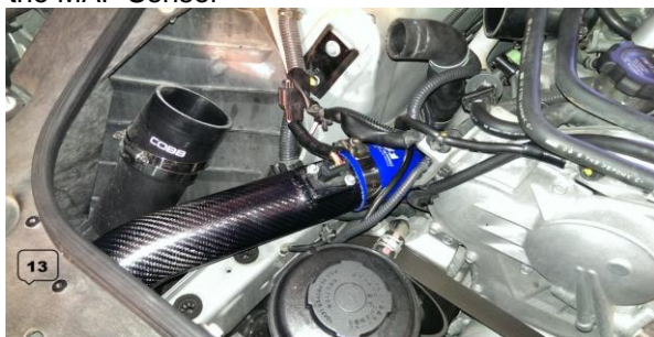
13. Over All View of the CF Pipe installed