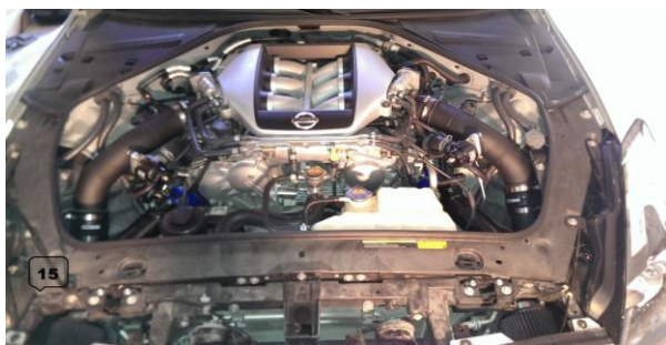
15. Complete View of CF intake Pipes Installed