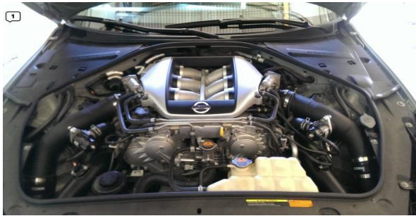
1. Nissan GTR Engine Bay with Aluminum Pipes