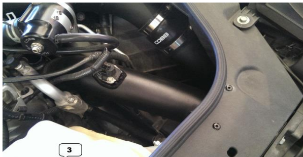
3. MAF Sensor Location