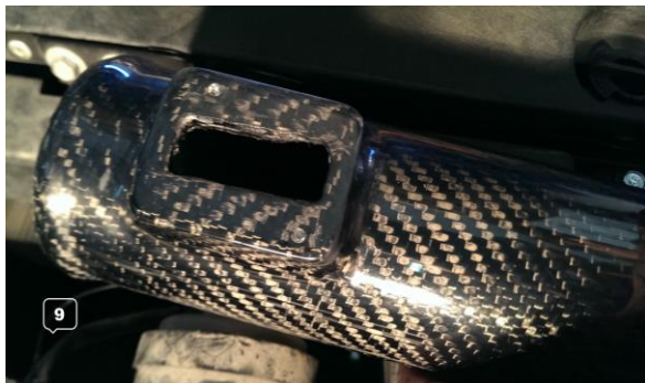
9. Need to Pre Align the Stock MAF Sensor to the CF Pipe Sensor Opening, Than required to drilled the Fitting Holes by 1/8" Drill Bits

4109 Billy Mitchell Dr. Addison, Texas 75001 Tel. 972.233.0888