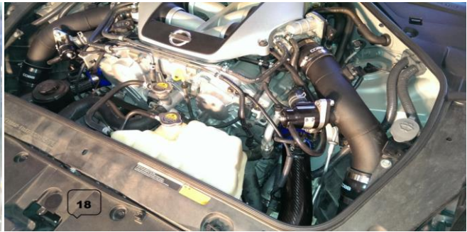
18. Overall Side View of Complete Installed