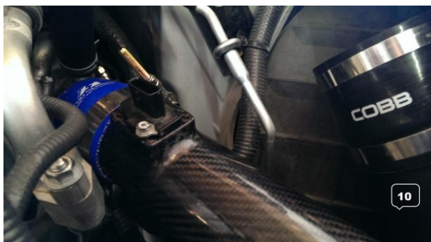
10. MAF Sensors Mounted back on to the CF Pipe