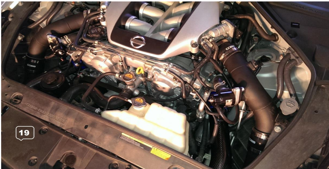
20. Upper Overall View of Completed Installed