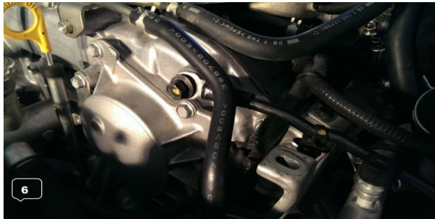
6. Disconnect the Negative Cable on Both sides