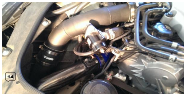
14. Mount the Upper Hard Pipes back on both sides